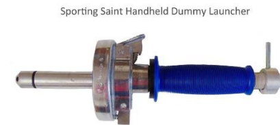
Sporting Saint Handheld Dummy Launcher

Improper maintenance and failure to properly and firmly position the Launcher Stock may result in serious injury or death.